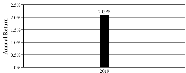
Annual Total Returns (years ended 12/31)

Highest Quarterly Return: 0.58% (Q2, 2019) Lowest Quarterly Return: 0.41% (Q4, 2019)